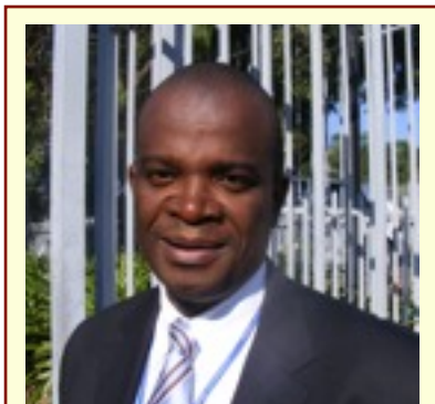
Chairperson of JOASA Gauteng