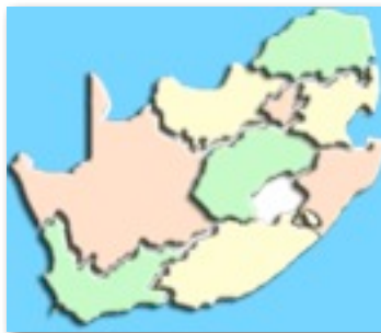
UPDATE ON EVENTS IN THE VARIOUS PROVINCES (P.4)