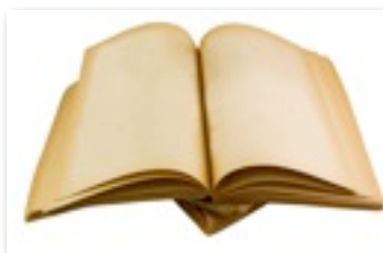
DRAFT REGULATION WORKSHOP (P.8)