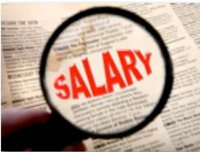
REPORT ON SALARIES (P.3)