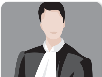
MATTERS OF INTEREST (P.8)