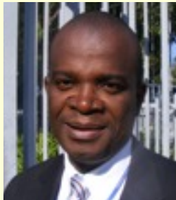
Chairperson of JOASA Gauteng

On the 29th of May, JOASA – GAUTENG held training workshop at the Pretoria North Magistrate Court.