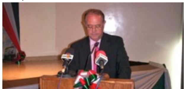
José María Bento Company