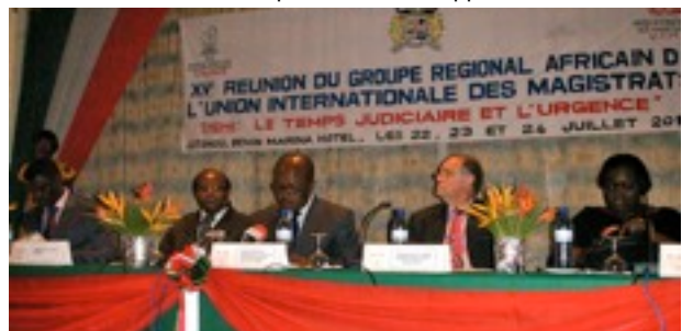
The Minister of Justice, legislation and Human Rights of Benin