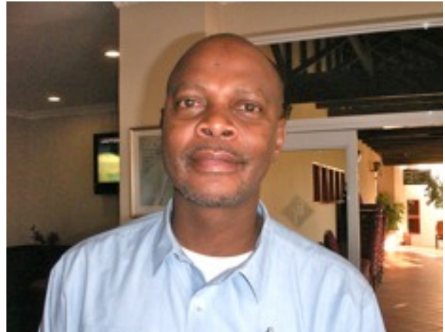
Chairperson of Gauteng, Xhanti Zeka

A real film showing the whole process from recruitment, to transportation and exploitation was shown to the delegates. This was very disturbing and it is hoped that more Magistrates will be exposed to this serious phenomena which has increased in South Africa.