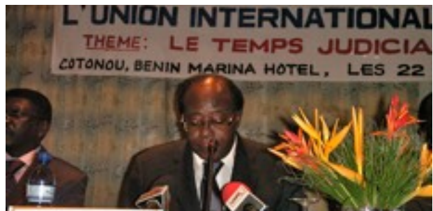
The President of the Supreme Court of Appeal of Benin